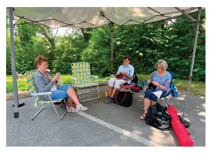
Crafters at work at the 2023 Quilter's Retreat in Berea.

This meeting was also full of truth. I joined with women of all ethnicities, shapes, sizes and ages. We took time to discuss the hypocrisy of what we say versus what we do, examining statements like "all are welcome" and "come as you are." Are we practicing these? Do we truly mean what we say? Does it just sound good? This discussion left me to pause and reflect on all that takes place in my mind and my heart.