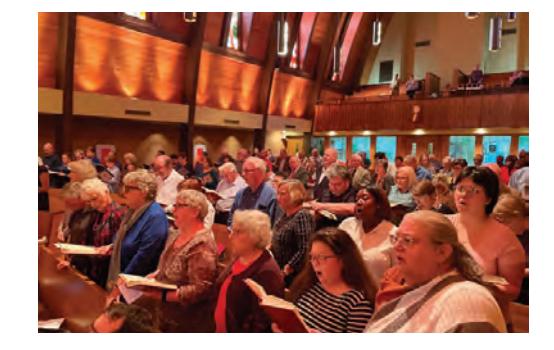
Congregants came together to praise God through the gift of music during All Disciples Sing 2023.

In addition to the offerings shared by the various churches, the full congregation sang a collection of hymns in honor of All Saints Day. At the communion table we named aloud the saints we have known, and we reflected on how our music that night might be practice for the day when we will gather with all of those saints — the great cloud of witnesses and rejoice and sing "Holy, holy, holy, Lord God Almighty!"